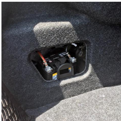
2015 Chevrolet Malibu LTZ Trunk side-wall example